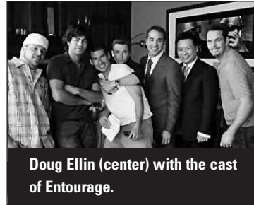
Doug Ellin (center) with the cast of Entourage.